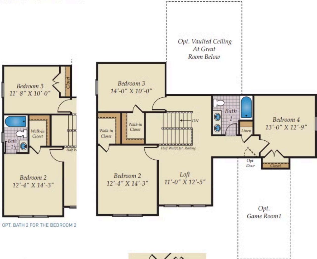
OPT. BATH 2 FOR THE BEDROOM 2