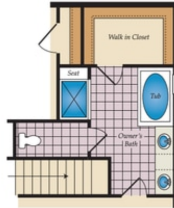
OPT. OWNER'S BATH