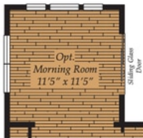
OPT. MORNING ROOM