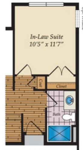
OPT. IN-LAW SUITE