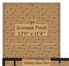
OPT. SCREENED PORCH