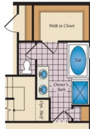
OPT. OWNER'S BATH W/LOFT