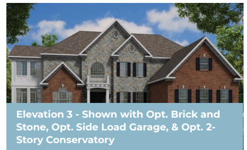
Elevation 3 - Shown with Opt. Brick and Stone, Opt. Side Load Garage, & Opt. 2-Story Conservatory