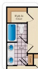
OPT. BATH #3