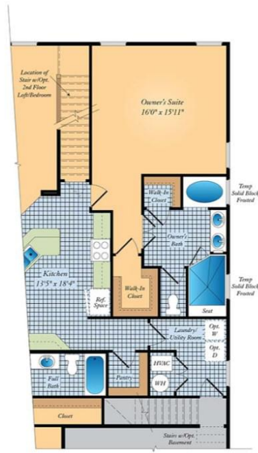
Alt. Owner's Bath