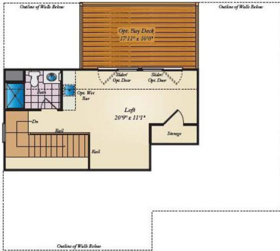
OPT. LOFT PLAN