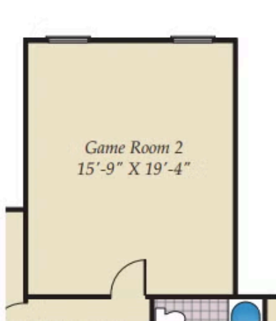
OPT. BONUS ROOM