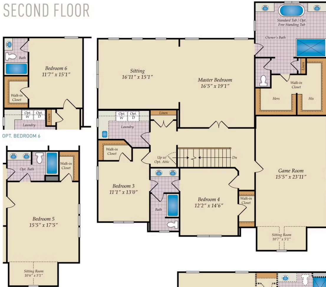
OPT. BEDROOM 6