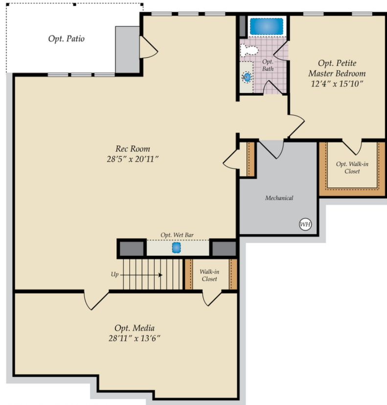
OPT. FINISHED BASEMENT