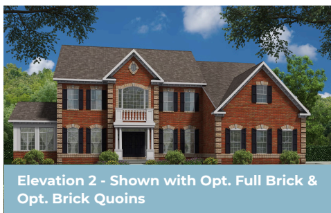
Elevation 2 - Shown with Opt. Full Brick & Opt. Brick Quoins