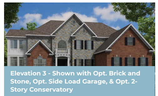
Elevation 3 - Shown with Opt. Brick and Stone, Opt. Side Load Garage, & Opt. 2-Story Conservatory