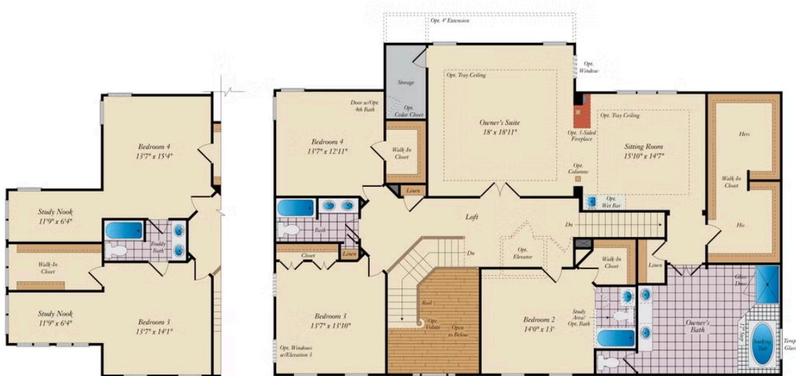
OPT. BUDDY BATH WITH OPT. 2-STORY CONSERVATORY