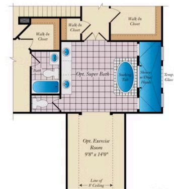
OPT. THOMAS'S CHOICE BATH W/ OPT EXERCISE ROOM