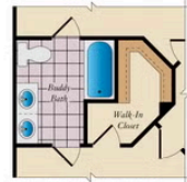
OPT. BUDDY BATH