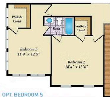
OPT. BEDROOM 5 W/ OPT. FIRST FLOOR CONSERVATORY