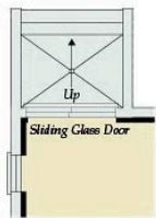
OPT. DOUBLE AREAWAY