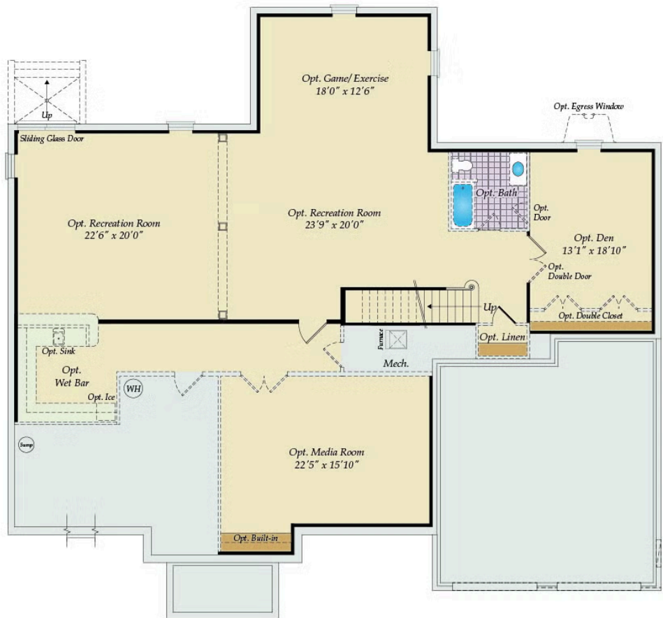
OPT. FINISHED BASEMENT