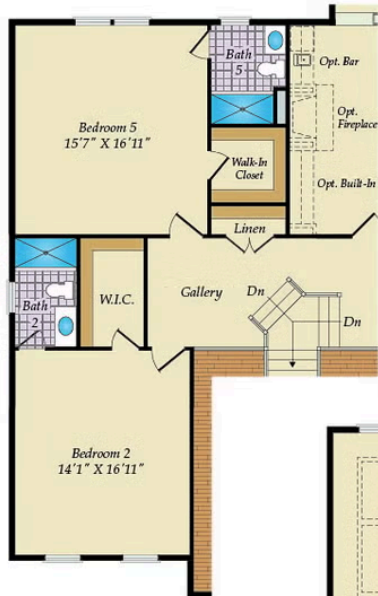
OPT. BEDROOM 5 & BATH 5