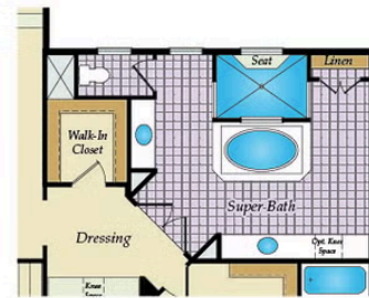
OPT. SUPER BATH