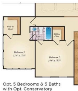
Opt. 5 Bedrooms & 5 Baths with Opt. Conservatory