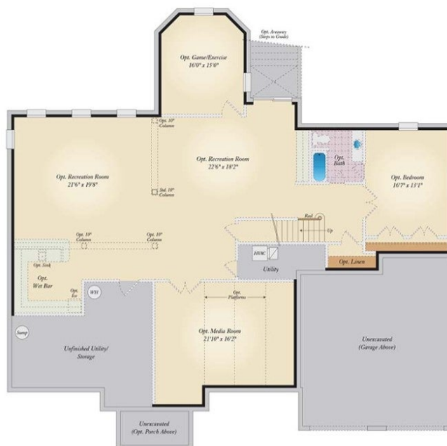
Opt. Finished Basement