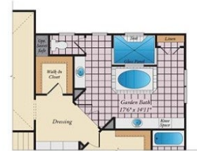
Opt. California Super Bath