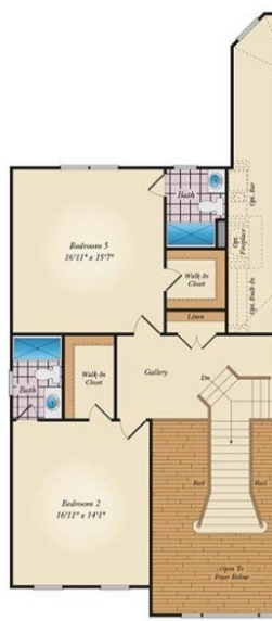
Opt. 5 Bedrooms & 5 Baths