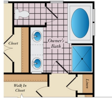
OPT. SUPER BATH