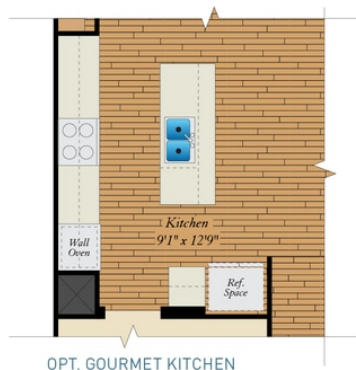
OPT. GOURMET KITCHEN