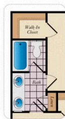
OPT. BATH #3