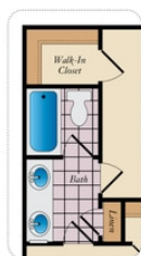
OPT. BATH #3