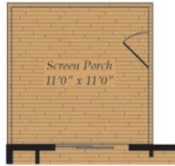
Opt. Screen Porch