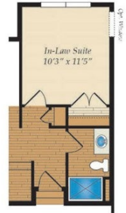
Opt. In-Law Suite