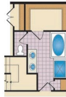
Opt. Super Bath w/ Loft