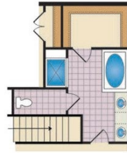
Opt. Super Bath