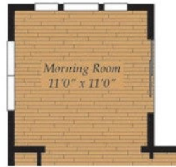
Opt. Morning Room