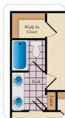
OPT. BATH #3