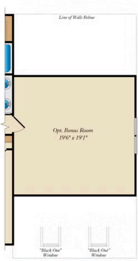
OPT. BONUS ROOM